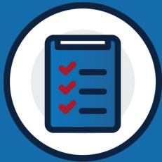
TRANSITION PROGRAM OVERVIEW