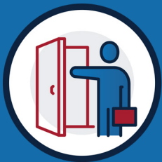
EFFECTS OF CAREER CHANGE