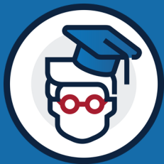
EDUCATION & CAREER PROGRAMS