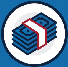
BENEFITS & ENTITLEMENTS